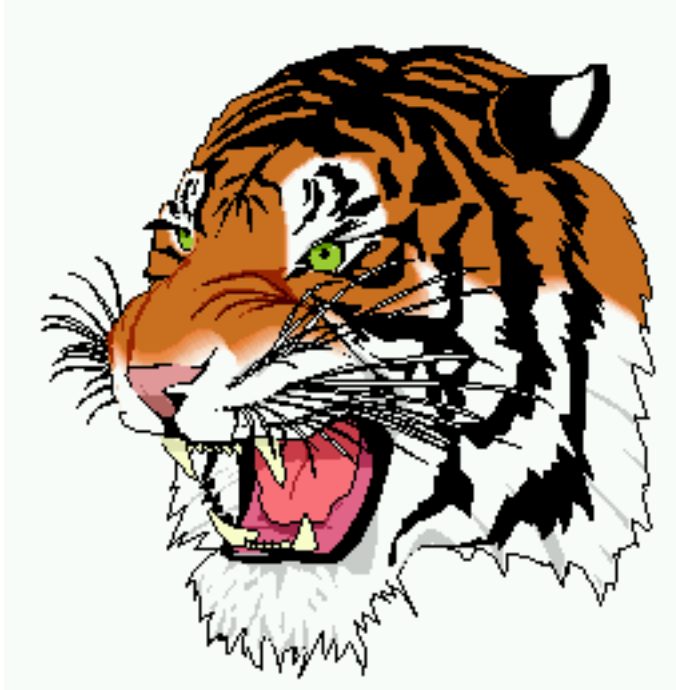
Figure 1. Tiger block image