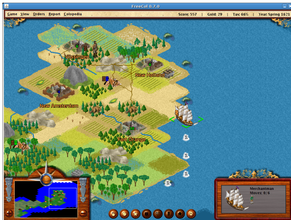
Figure 1: The main screen.

The figure 1 represents the main screen.